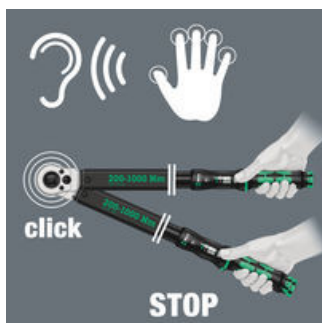
On reaching the desired torque value, an audible and tactile mechanism is triggered.

Further versions in this product family: