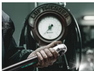
Reversing with square head insert