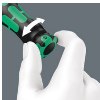
With audible and tactile locking when the scale values are reached.