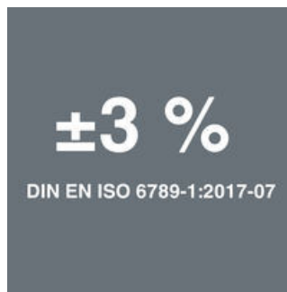
Precision of \pm 3\% as per DIN EN ISO 6789-1:2017-07.

The Click-Torque torque wrench is suitable for clockwise and counterclockwise torque operation. Very smooth change of direction thanks to captive square head insert.